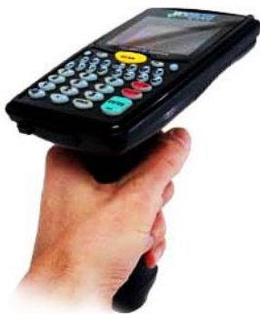
Hand held data collection

The MISys Worth Terminal Manager gives production managers and inventory managers more control from the shop floor and the warehouse. It is designed to work with Worth Data's 7000 Series RF Terminal platform connected to a Worth Data Base Station, connecting wirelessly with MISys Manufacturing. Using this Radio Frequency technology, users can receive and display detailed information and initiate a full range of factory floor operations in real-time.